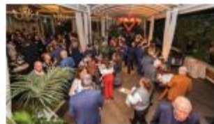
Guests enjoying cocktails & hors d'oeuvres

Thank you to everyone who attended this marvelous evening!